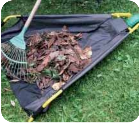
JG8071 FOLDING WHEELBARROW £29.00

Once full, simply pick up the handles and roll along like a traditional wheelbarrow. The tear proof durable fabric holds up under a load of firewood and the soft sided design stabilizes the load. It also folds down for easy storage.